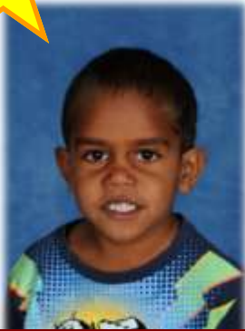
Kindy– Hard Working Week