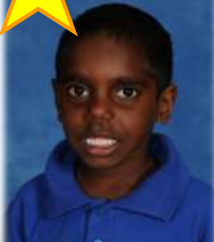
Yr 1/2– Independent Worker