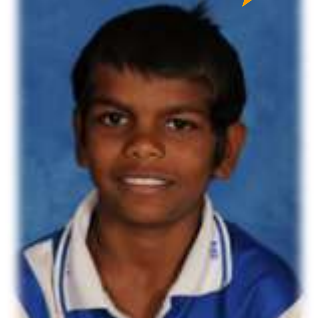
Yr 5/6/7– Showing Leadership in Class