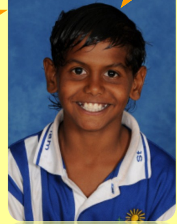
Yr 5/6/7— Music Man