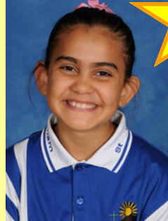
Yr 3/4— Brilliant Week