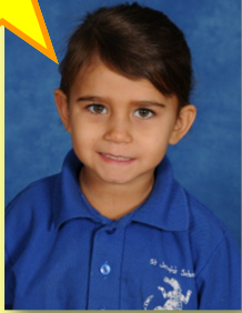
Kindy— A positive Attitude