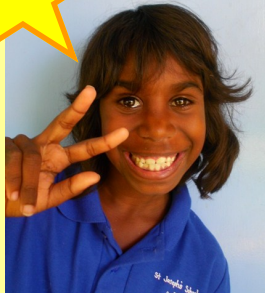
Yr 1/2— Effort and Listening